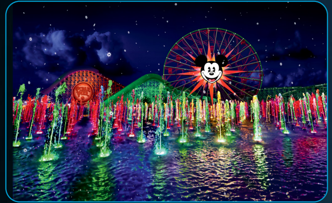
Disney properties/artwork: ©Disney

*If the event is canceled due to inclement weather, PDA will inform the sponsor of alternative options.